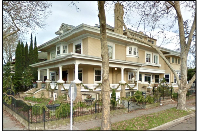
2131 F Street