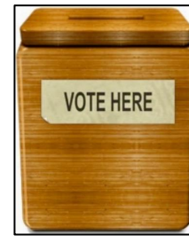
Society Church, 2711 B Street