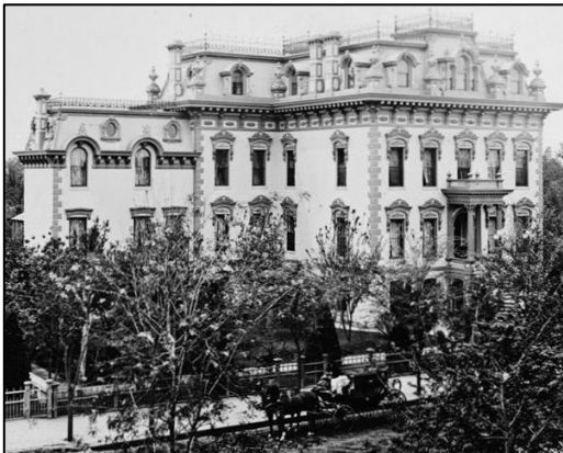
Muybridge’s 1872 photo of the Leland Stanford Mansion

For a videorecording of a 2014 KCRA news feature about Muybridge’s photographic project and its connection to Boulevard Park, go to the history pages of the BPNA website ( https://www.boulevardpark.org/history ).