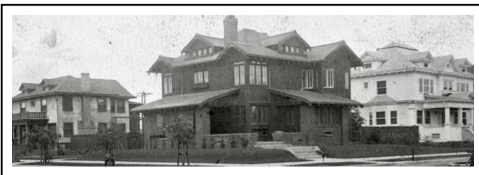
A vintage view of the three houses used for recent BPNA gatherings: 617 21st, 2101 G, and 2115 G (photo taken in about 1911).

Boulevard Park's own Capital Brass Quartet will present a free concert of Christmas favorites at 3:00 p.m. on Sunday, December 22. Weather permitting, it will be held in the alley park between F, G, 21st, and 22nd Streets. Please enter the park from Fog Alley on the west side of 22nd street. If the weather is really cold, the musicians may move onto the front porch of the Arthur house (614 22nd, to the right of Fog Alley) so that they can plug in electric heaters and keep their hands warm and their instruments in tune. Whether seated in the park or on the grassy median, everyone attending the concert should bundle up, bring a blanket or a lawn chair, and enjoy the festive music of the season.