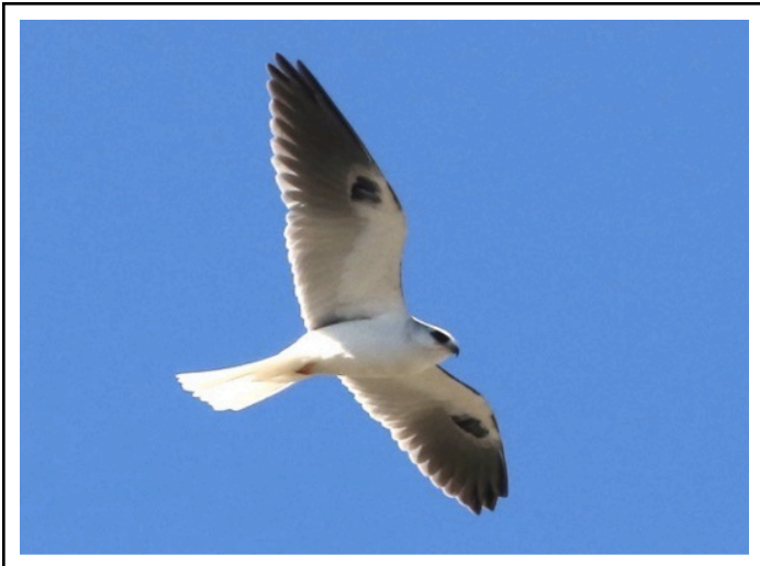
A White-Tailed Kite at Sutter's Landing Park.